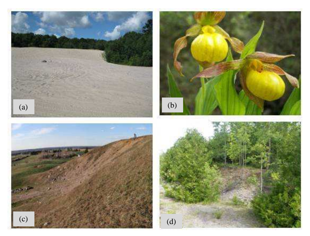
Figure 2: MAAP research is driven by the need to broaden the range of rehabilitation options given such constraints as (a) lack of soils; (b) unique species; (c) steep eroding slopes; and (d) stages of naturalization.

To date, over 6.1 million has been spent on 322 projects that have rehabilitated over 520 hectares of land. However, many of these properties exhibit severely degraded soils (lack of quantity and organics (Figure 2(a)), unique species (Figure 2(b)), difficult microclimates, steep and eroding slopes (Figure 2(c)) and are at various stages of naturalization (Figure 2(d)).