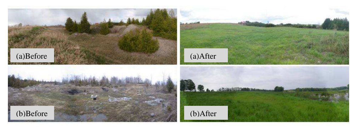
Figure 1: MAAP rehabilitation projects, (a) abandoned aggregate site prior and post rehabilitation to agriculture, 0.5 ha, Township of Mariposa, City of Kawartha Lakes; (b) abandoned aggregate site prior and post rehabilitation to natural area, Township of Keppel, Grey County, 3.0 ha.

Historically, the majority of the sites have been rehabilitated to agricultural land (Figure 1(a)) or natural areas (Figure 1(b)). Some have been transformed into recreational areas, such as public parks, sports facilities and outdoor educational areas. However, the opportunity to reclaim the abandoned properties by creating, enhancing and connecting habitat, all while eliminating safety concerns, has been recognized by the MAAP program.