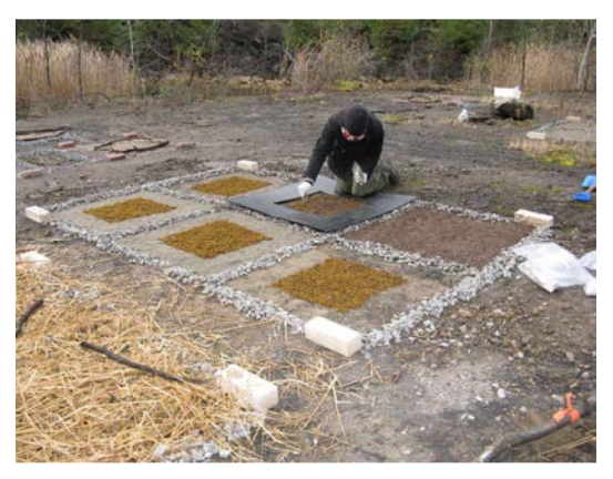
Figure 4: Spreading moss fragments on the central area of each plot, showing the surrounding 'rock ridges'.

a substrate composed of small particles (sand and gravel) in comparison to bare rock, and with the addition of topography, 'rock ridges', around the plots (Figure 4), higher establishment rates occurred. However, the addition of both sand and gravel substrate, and 'rock ridge' topography did not compensate for the absence of straw mulch. Work is currently ongoing to determine if a thin layer of silica sand and low nutrient doses will further increase moss establishment.