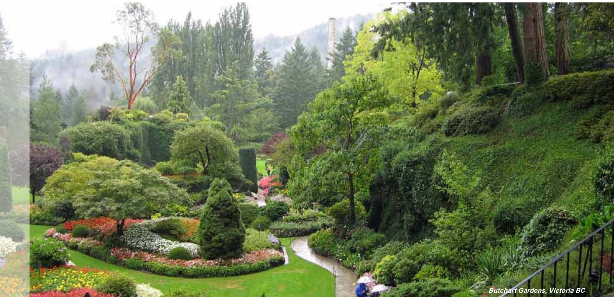
Butchart Gardens, Victoria BC