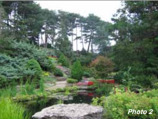
Photos 2 & 3. The Royal Botanical Gardens (RBG), Hamilton, Ontario.

A botanic educational garden and scientific institute created in a 160 year old exhausted china clay or kaolin quarry. The site is now a spectacular educational garden with unique rehabilitation and over a million visitors per year while employing 450 people. It was constructed below the water table. It is the local economy engine for this area of Cornwall.