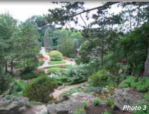
Photos 4 & 5. Parr Lake North Park & Parr Lake South Park, Brampton, Ontario.

The RBG created an extraordinary rock garden in an abandoned gravel pit situated on the Niagara Escarpment. In 1929, work began to create the picturesque sunken rock garden. The RBG is reputed worldwide for its first-class horticultural collection and natural lands. In 1976 it received the first ever Ontario Stone, Sand and Gravel Association (OSSGA) Bronze Plaque award for restoration of a gravel pit to a world recognized garden.