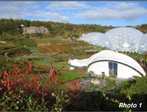
Photo 1. The Eden Project, Bodelva, Cornwall, England.

A botanic educational garden and scientific institute created in a 160 year old exhausted china clay or kaolin quarry. The site is now a spectacular educational garden with unique rehabilitation and over a million visitors per year while employing 450 people. It was constructed below the water table. It is the local economy engine for this area of Cornwall.