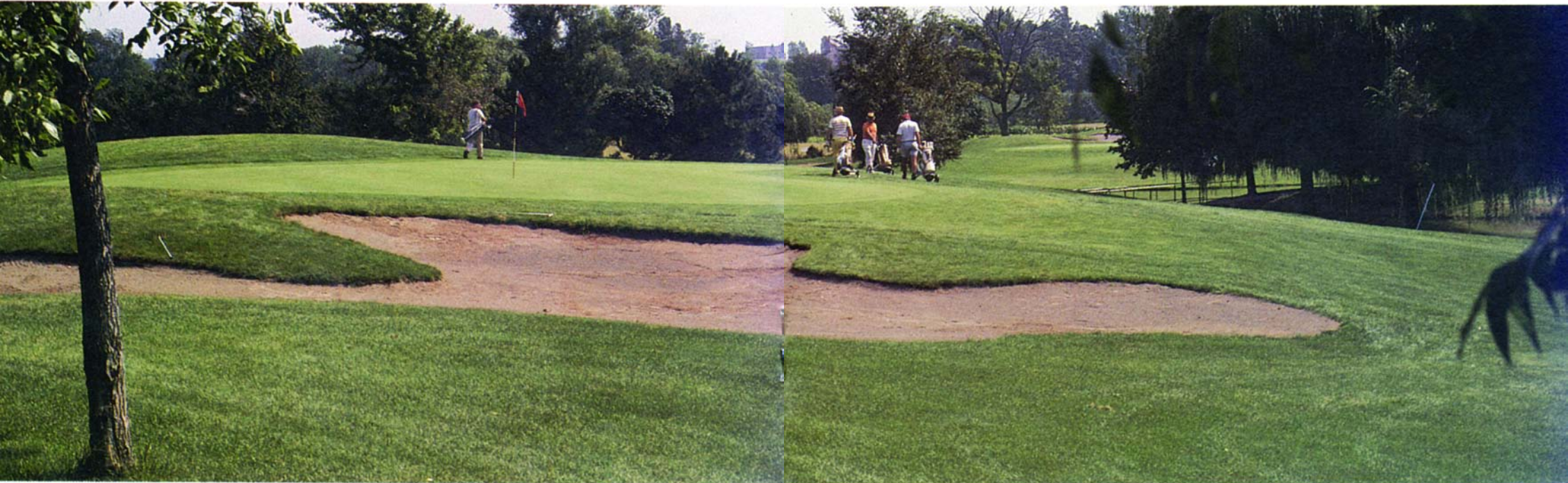
The Steed and Evans site west of Fonthill has been progressively rehabilitated since 1970 to a golf course; fourteen holes have now been completed.

It is often impossible to determine one specific after use where extracting operations may continue for ten or more years. However, with a site plan, it is possible to shape the land to accommodate a wide range of possible after uses.