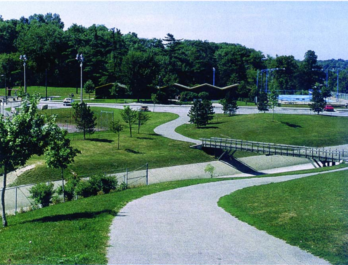
Smythe Park in Toronto's west end received the 1977 Aggregate Producers' Association of Ontario Rehabilitation Award.

Similar analogies can likely be found in other urban areas.