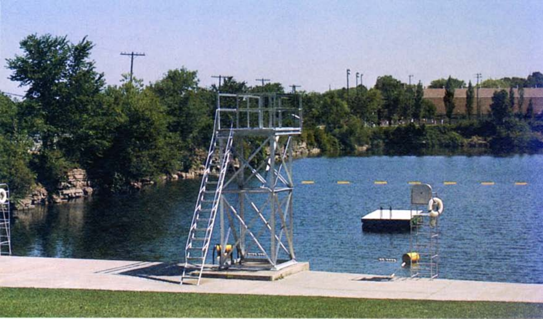
The St. Mary's swimming pool is a former quarry situated within the town limits.