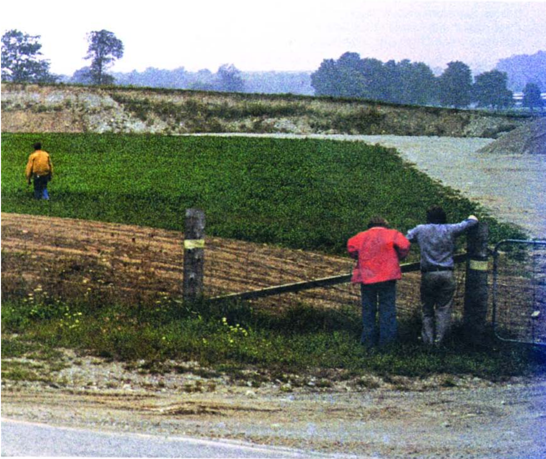
Regional Municipality of Waterloo pit rehabilitated to agriculture in North Dumfries Township: crop of alfalfa.