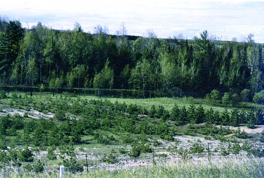
This rehabilitated pit is in Uxbridge Township, northeast of Toronto (Standard Aggregates).