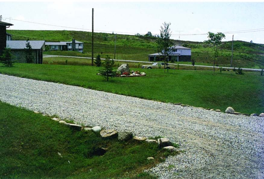
This subdivision in the hamlet of Mono Mills, east of Orangeville, was built without sterilizing valuable resources; the aggregate was extracted first.