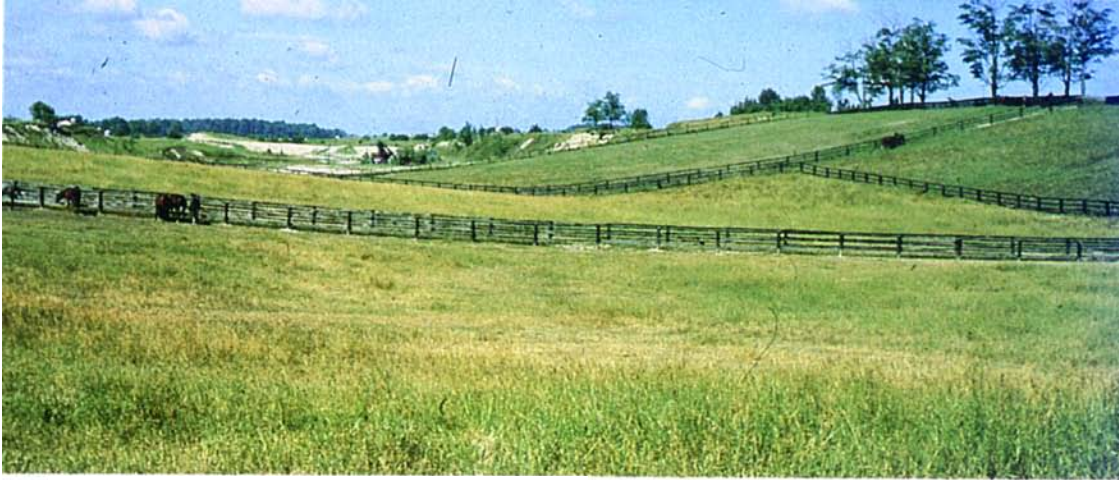
Site rehabilitated to agriculture in Whitchurch-Stouffville.