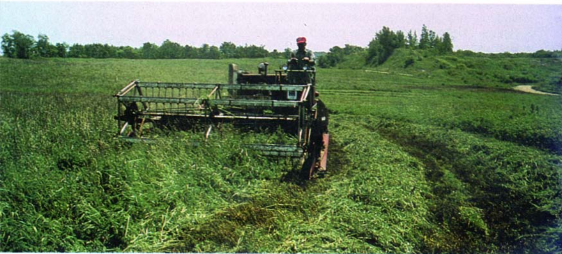
Site being progressively rehabilitated to agriculture (TCG, Brantford).

A special land use concept relating to rehabilitation is referred to as sequential land use . This is a practice in which mineral aggregate resources are removed immediately before an area is built over by incompatible uses such as a residential subdivision which would otherwise sterilize the aggregate resource. This concept can be put into practice most often in cases where an urban municipality is expanding into an urban fringe area having valuable aggregate resources.