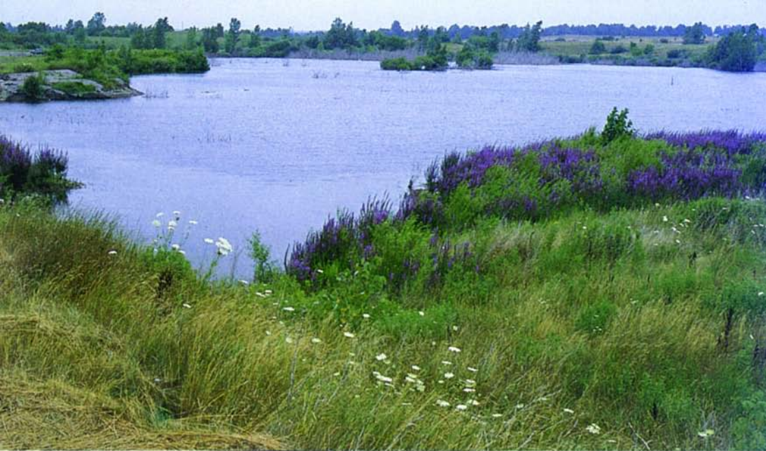
Wildlife flourishes in this nature area Paris, Ontario while extraction continues nearby (Standard Aggregates).