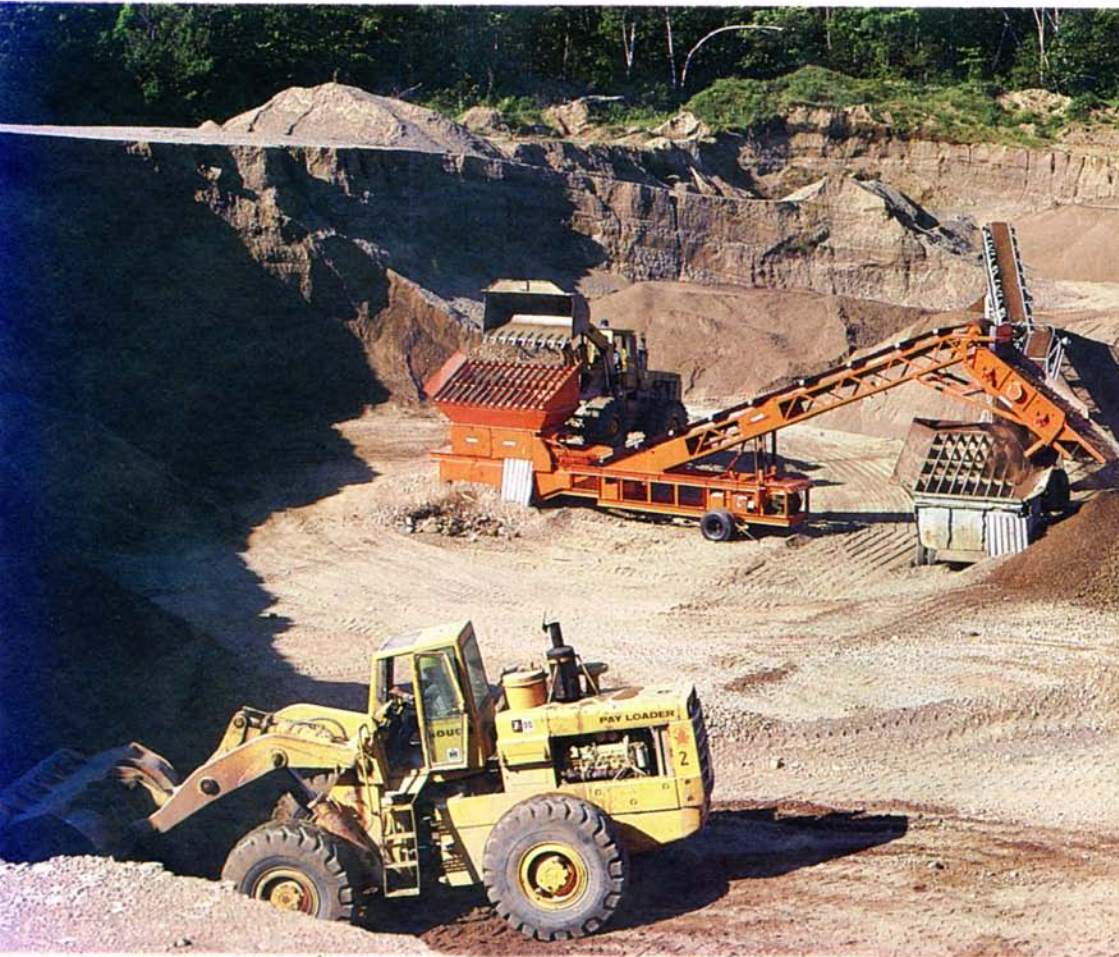
Aggregate operation in Uxbridge Township.