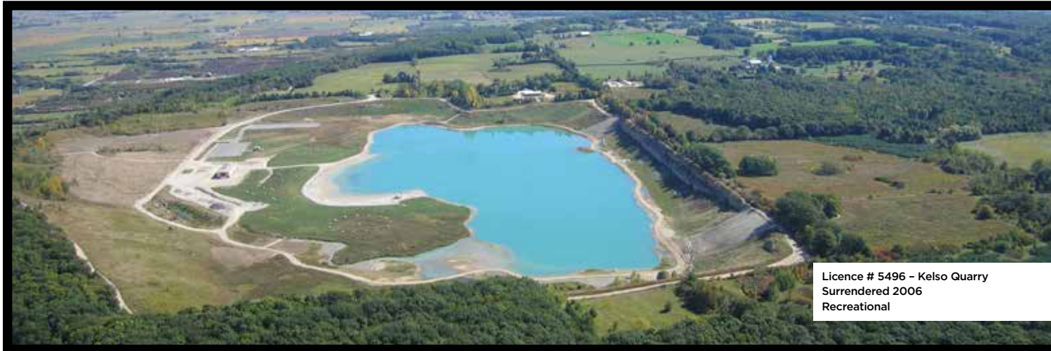
Licence # 5496 - Kelso Quarry Surrendered 2006 Recreational