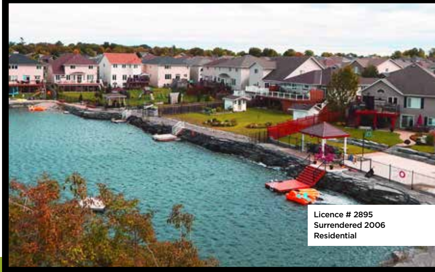
Licence # 2895 Surrendered 2006 Residential