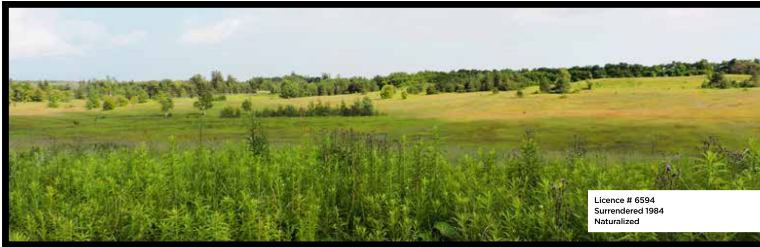
Licence # 6594 Surrendered 1984 Naturalized

TOARC has created a database of surrendered sites across the Province using MNR and TOARC data, municipal records, and aerial imagery. We may have information of a surrendered site on your property, or one close to you and would appreciate the opportunity to discuss the site with you. Obtaining information and gaining access to rehabilitated sites will be key to the success of this research.